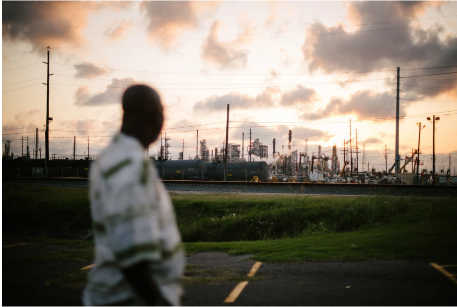
The Motiva oil refinery in Texas. The Houston Ship Channel is a petrochemical hub adjoining neighborhoods with sizable numbers of Black and Hispanic residents.